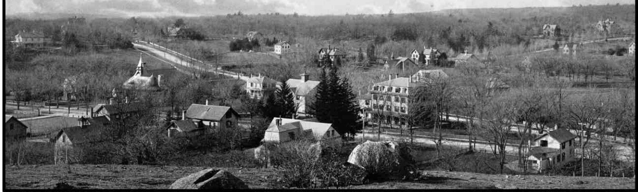
VIEW OF WELLESLEY HILLS - Circa 1890 Washington Street and Worcester Turnpike (Route 9) intersection. Unitarian Society Steeple visible at center left

This congregation emerged following a split with the local Congregational church in the years after the American Civil War. Many residents of what was then the Grantville section of Needham found themselves dissatisfied with what was then known as the Orthodox Congregational Church of Grantville (now known as Hills Church - Congregational). Although the nearest Unitarian congregation was less than three miles away in Needham, it did not seem to provide the community experience the earliest members of our Society were seeking. In 1869, sixty-seven residents of Grantville formed a committee to establish their own congregation and founded the Unitarian Society of Grantville with institutional support from the American Unitarian Association (AUA).