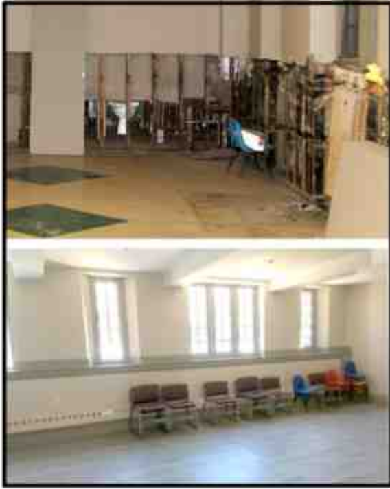
Before and After pictures of the Activity Room where the flooding began.

The donated funds made possible the remodeling and the restoring of the interior and basement level of Parish Hall. Old inaccessible plumbing for water, heat, and waste was replaced. The plan called for a thorough renovation of Rice House. Mechanical systems were replaced, two new bathrooms were created, offices for church staff were reconfigured, and the meeting area was updated. Air conditioning systems were installed in Rice House and in the chapel for summer services.