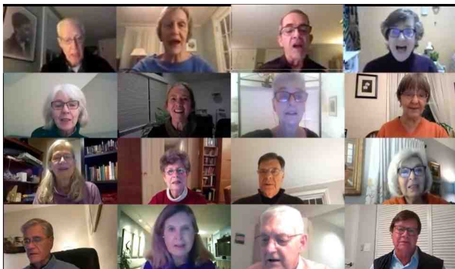
The choir sang on a Zoom online service during the 2021 pandemic

While the hope at UUSWH is to return to in-person programming as soon as it is safe for everyone to do so, in all likelihood, this congregation will rely on a hybrid model in the future, one that makes good use of newer technology. We do not know all the innovations that we may yet see happen.