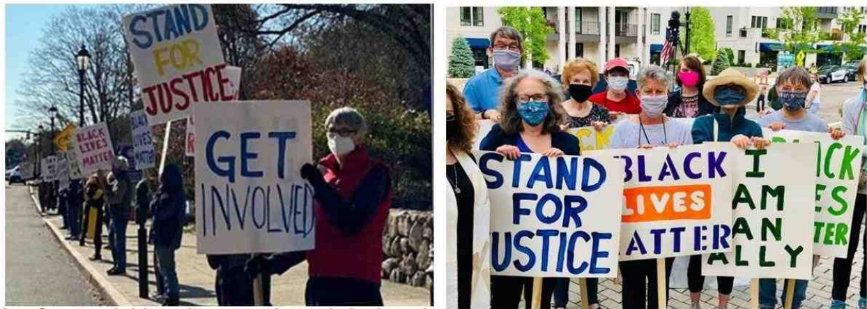
One of the few activities that continued during the pandemic

six feet apart on the sidewalk as they witnessed for racial justice. Because our congregation is not as old as some other UU parishes in the area and was founded in post-bellum America, we do not have as troubled a history as those congregations with long-standing connections to the trans-Atlantic African slave trade.