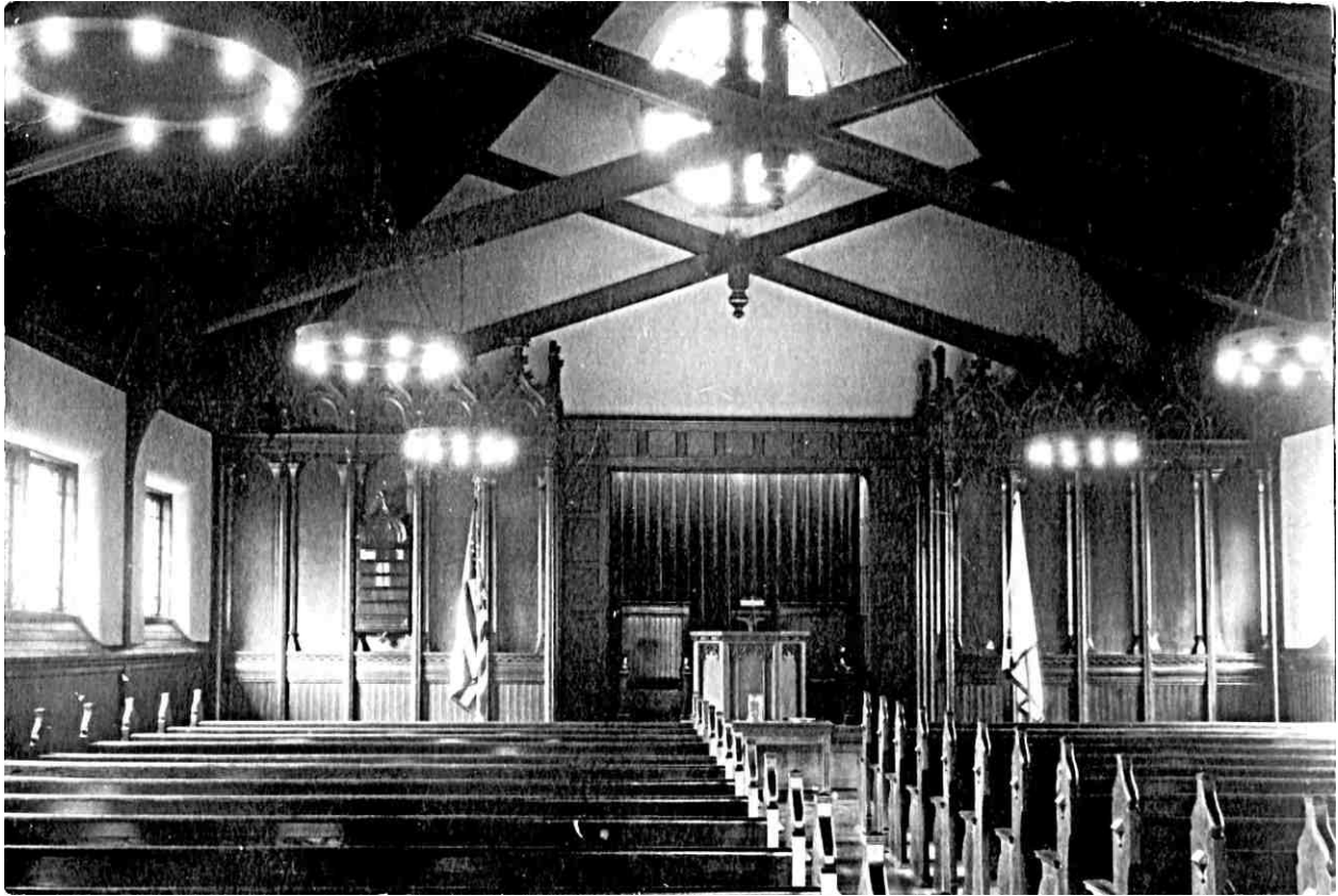
Interior of the original stone building, in a photo taken circa 1925 before Hatch Rose Window installed. The Parish Hall addition in 1929 was built in similar style with dark wood panelling and circular light fixtures. Some items from this sanctuary including the lectern, hymn board, and Hatch Rose window (1929) would be transferred to the new sanctuary building in 1960.