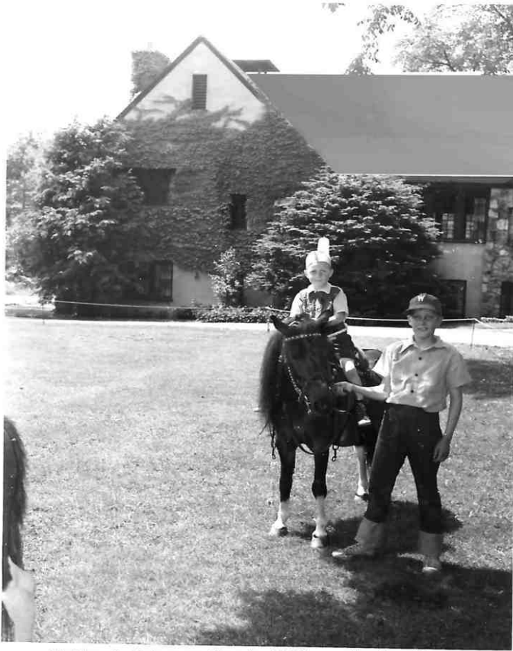
Children's Fair sometime in 1950s, on the front lawn before the new sanctuary was built